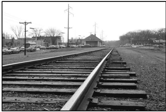
Dakota Rail / Trail – After the rails and ties were removed, this part of the Three Rivers Park Trail System was dedicated in 2009.