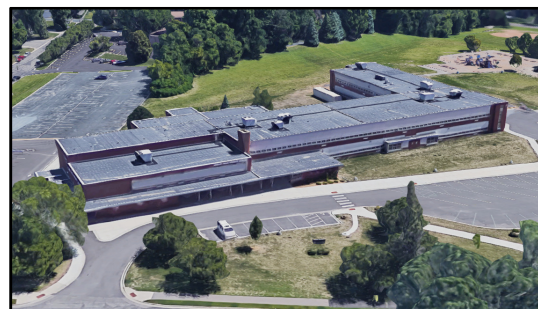
Shirley Hills Primary School – Opening in 1951, this was the first school building built since 1938. It welcomed post-World War II’s expanding population.