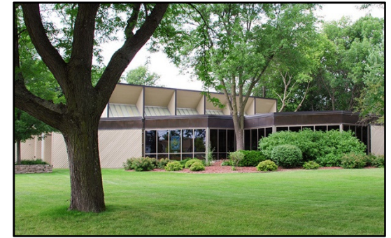
Westonka Library - Public library service in Mound and the surrounding communities began in 1915, when Minneapolis Public Library made a small book collection available to area residents.

Presented by: Westonka Historical Society Westonka History Museum Centennial Building 5341 Maywood Road Mound, MN 55364 952-471-9800