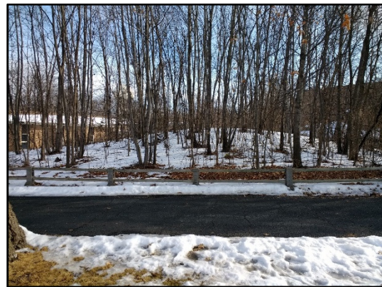
Prehistoric Earthwork – Hundreds of earthworks (mounds) were built on the bluffs of Lake Minnetonka thousands of years ago by the first people to live here.