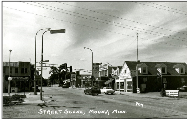
STREET SCENE, MOUND, MINN.