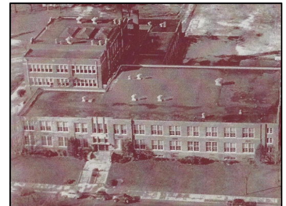
Mound Consolidated High School – The first high school building opened in 1917, with an addition in 1926, and another in 1938 with a 1200-seat auditorium.