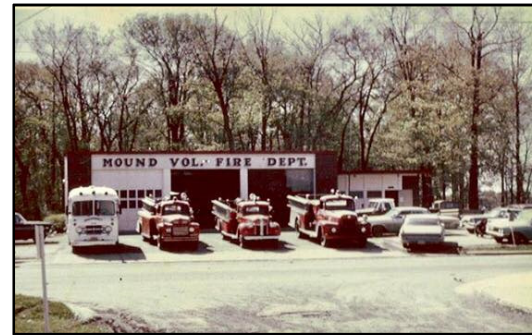
Mound Volunteer Fire Department – Building built about 1939, replaced by current building shared with the staff of the City of Mound and Orono Police.