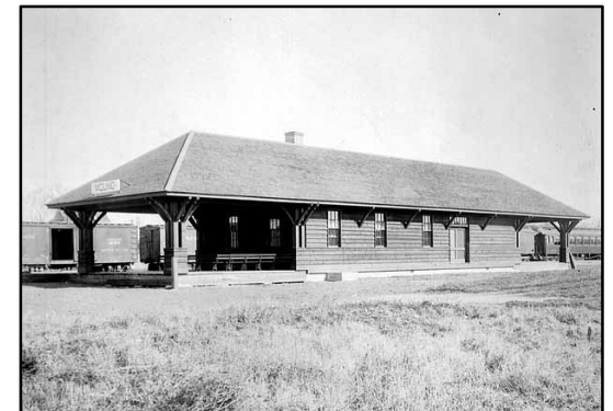
Mound Train Depot – JJ Hill’s railroad came to Mound in 1900, depot was built in 1915. It was moved to Surfside Park in the middle of the night in 1967.