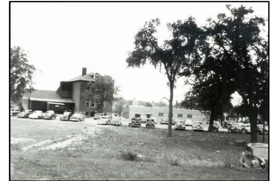
Early Schools - School building site from 1860 until 1940s. Last brick school building became first home of Mound Metalcraft/Tonka Toys in 1946.