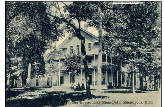
Chapman House – Built in 1875, the Chapman House had 35 rooms for guests, along with a kitchen, parlors, office and store rooms. also had a boathouse, which later became the Surfside Casino.