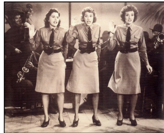
The Andrews Sisters Trail – This popular singing trio summured on Cooks Bay and topped the charts in the 1940s-1950s with more hits than Elvis and the Beatles combined. The Andrews Sisters Trail was named in their honor in 2008.