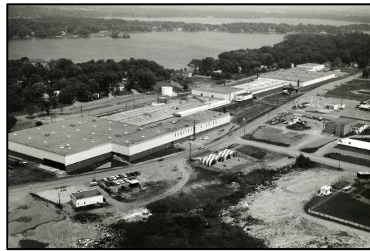
Tonka Toys Building – Opening in 1955, trains delivered sheet metal at the west end, and trucks loaded cartons of Tonka Toys at the east end, until 1982.