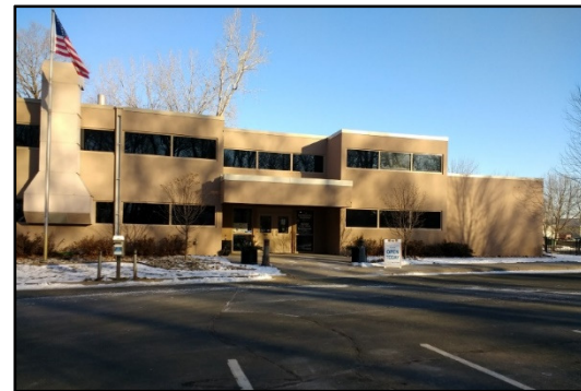
Westonka History Museum – Having occupied several storefronts and survived several moves to storage, the museum found a home here in 2016.